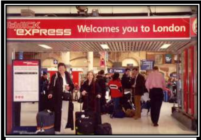
Figure 6 Arrival at Gatwick