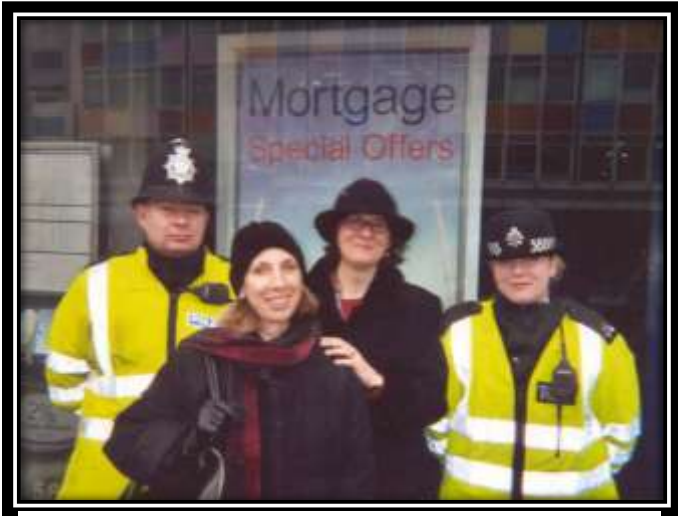
Figure 11 "Under Surveillance"