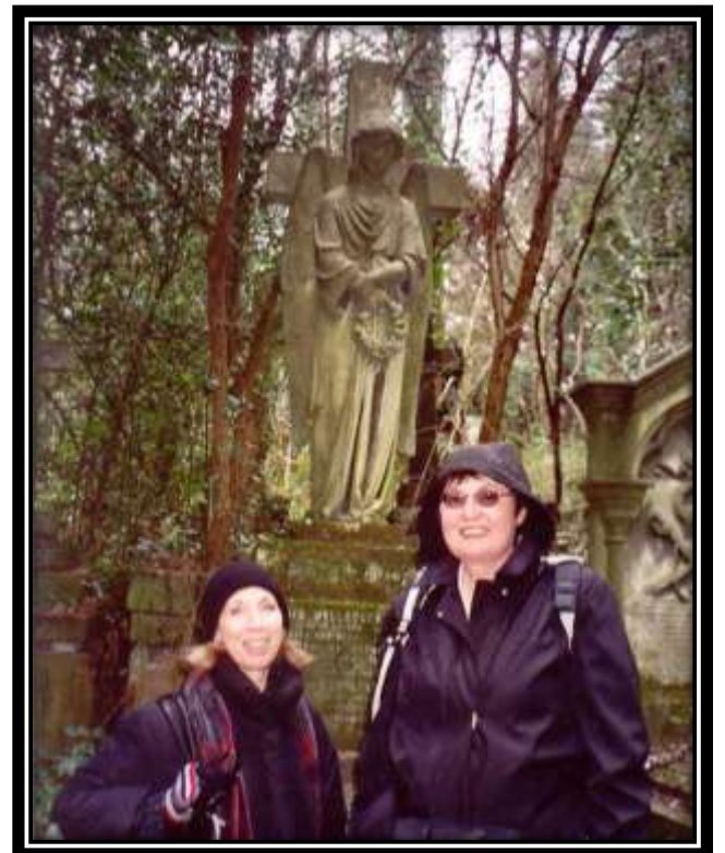
Figure 3 Highgate Cemetery