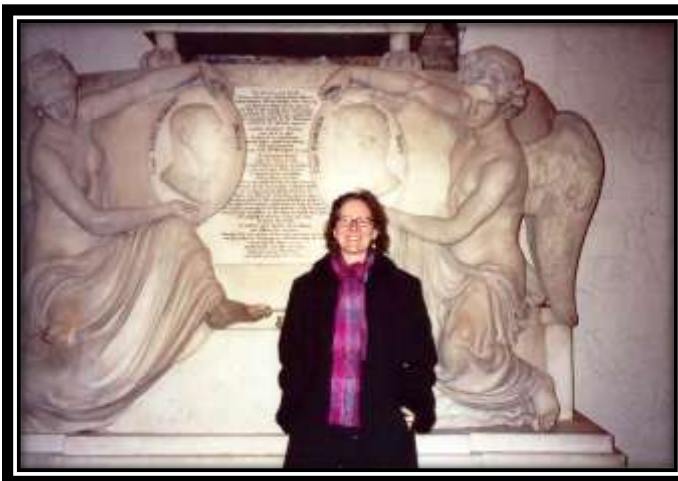
Figure 9 Natalie Cole in Liverpool