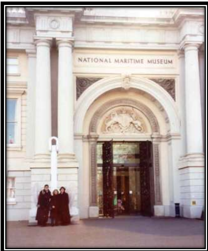
Figure 1 National Maritime Museum