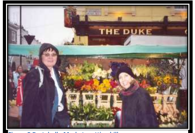
Figure 5 Portabello Market, notting hill