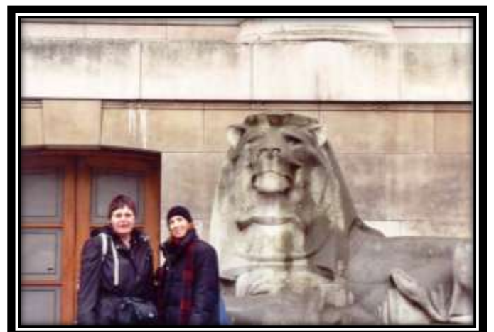
Figure 2 British Museum