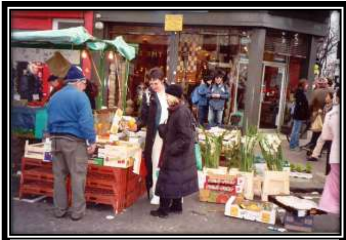
Figure 4 Portabello Market, notting hill