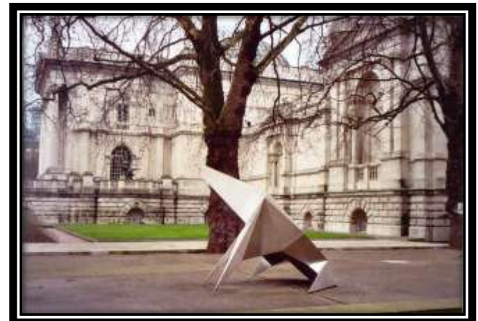
Figure 7 Tate Britain