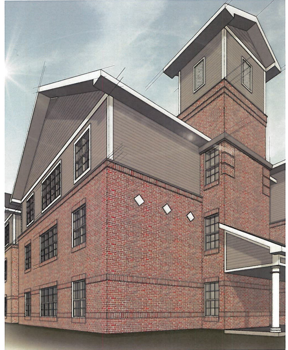
OAKLAND UNIVERSITY - AVN APARTMENTS RECLAD

The design team looked at multiple design schemes, siding options, shingle styles, and color schemes. The final decision on the palette was made in the field looking at actual material samples up against the brick, windows and existing building features. The palette selected provided the look and feel that the architect, housing department and facilities department were looking to achieve.